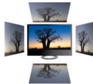
Standard Monitors Color shift appears