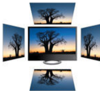
New VS Series - No color shift