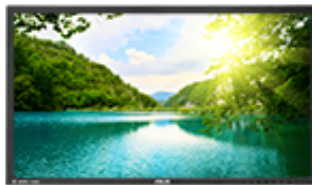
ASUS Eyecare monitors with the flicker-free technology