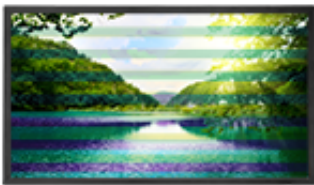
Conventional monitors without the flicker-free technology