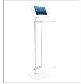
lilitab Banner Mount