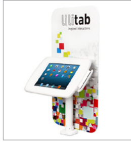
lilitab Counter Backdrop Graphic