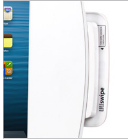
liliSwipe Secure Card Reader