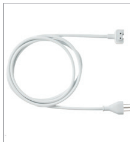
Power Extension Cord