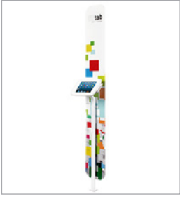
lilitab Backdrop Graphic