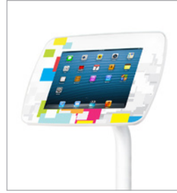
lilitab Faceplate Graphic