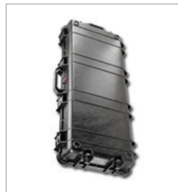
lilitab Floor ATA Flight Case