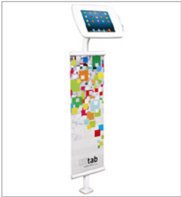
lilitab Banner Graphic