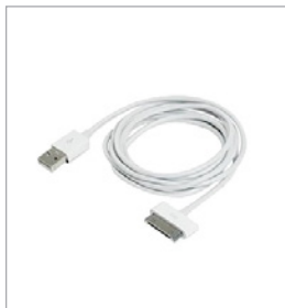
6' iPad Charge and Sync Cable