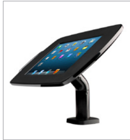
lilitab Surface Basic