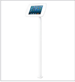
lilitab Floor Pro Line