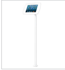
lilitab Floor Basic