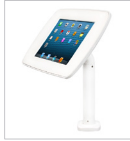
lilitab Counter Basic