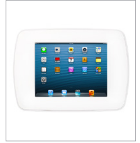
lilitab Head Unit