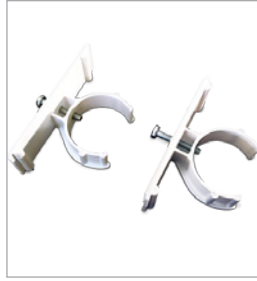
lilitab Backdrop Graphic Clips