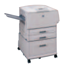
hp LaserJet 9000dn printer with optional 2000-sheet feeder