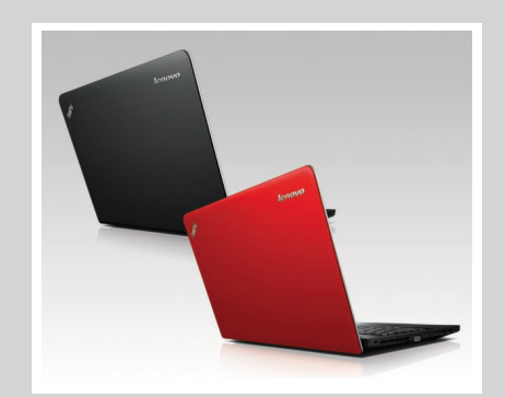
PROFESSIONAL SOPHISTICATION Soft-touch surface in Midnight Black or Heat Wave Red add a touch of class to any office

Lenovo® ThinkPad® E440/E540 laptops are a perfect blend of legendary ThinkPad® durability, Lenovo® OneLink convenience, and 4<sup>th</sup> generation Intel® Core™ i series processors. Offering unprecedented value, the E440/E540 go the distance for small businesses, home offices, and higher education institutions. Experience Windows 8 like never before with the 10-point, capacitive touch screen on an FHD display. The tactile experience continues with the 6-row, spill-resistant keyboard, and the TrackPoint® for easier navigation. Packed with the latest technology from Intel® and NVIDIA®, the highly customizable and expandable E440/E540 is perfect for serious number crunching or just HD movies in your time off.