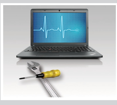
DESIGNED FOR GROWING BUSINESSES Lenovo® Solutions for Small Business simplifies and streamlines IT management

Up to 4<sup>th</sup> generation Intel® Core™ i7 processors, Windows 8 Pro, NVIDIA® discrete graphics, 1TB HDD, and 16GB RAM